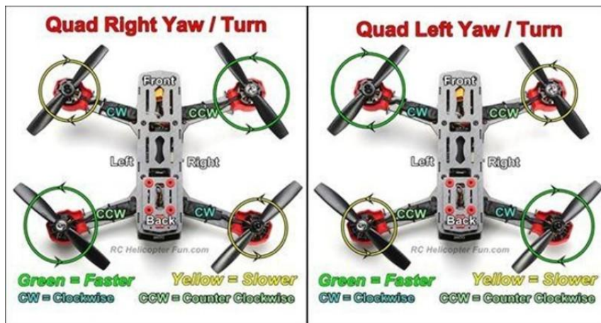
Figure 4. Yaw motions to the right and left

We also see a drone turning clockwise or anticlockwise about a vertical axis in addition to linear motions discussed above. Such turnings are called yaw motions. How are such turnings achieved? Let us say the blades with green circled blades are spinning faster in the anticlockwise manner while those coloured yellow are spinning slowly in the clockwise manner (figure 4). Remember that such diagonal pairing of blades is required for stability, as discussed earlier. Let us say we enhance the spinning rates of the green blades compared to the rates of the yellow ones, leading to a net angular motion of the blades in the anticlockwise manner. Hence, the body of the drone starts spinning or turning in the clockwise manner- again following Newton's third law for the conservation of angular momentum. It is amazing to realise that the spin rates control all possible motions of the drone! Alternatively, if the green-coloured blades are spun at a higher rate in the clockwise manner than the slower yellow blades turning in the anti clockwise manner, the body of the drone turns in the anticlockwise manner as illustrated in the right half of the same figure.