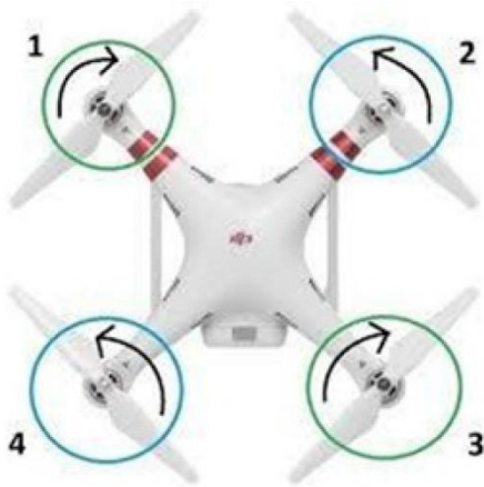
Figure 2. Top view of the rotating blades

The four specially shaped spinning blades (or propellers) at the corners are capable of spinning at different rates individually by a central control system. All of them do not spin in the same direction – if that were to happen it would cause the entire body of the drone to spin constantly in the opposite direction-following the law of conservation of angular momentum - something that we do not want. Hence, diagonally opposite blades along each diagonal (like 1 and 3) spin in one direction, while those along the other diagonal (like 2 and 4) spin in the opposite sense as shown in figure 2.