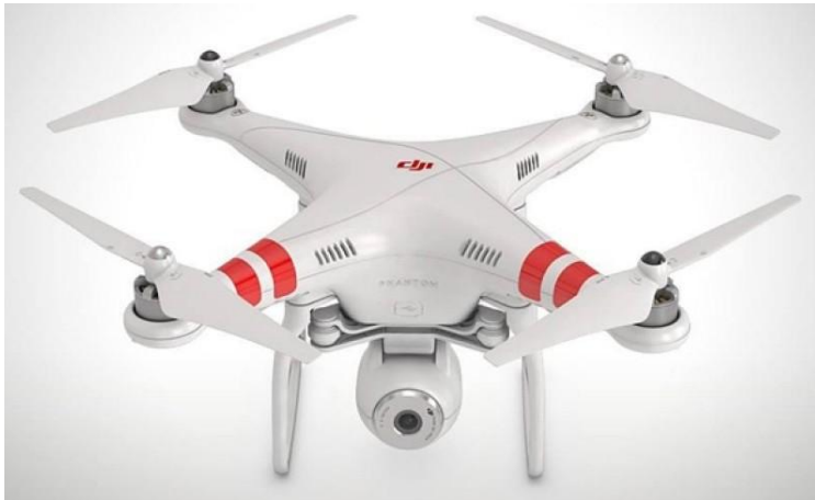
Figure 1. A quadcopter

The first quadcopter drone was invented by the Breguet brothers, Jacques and Louis Breguet, along with Professor Charles Richet in 1907. In the beginning they were impossible to steer and required four men for stabilization during their brief hover of just two feet off the ground! Since then, drones have come a long way!